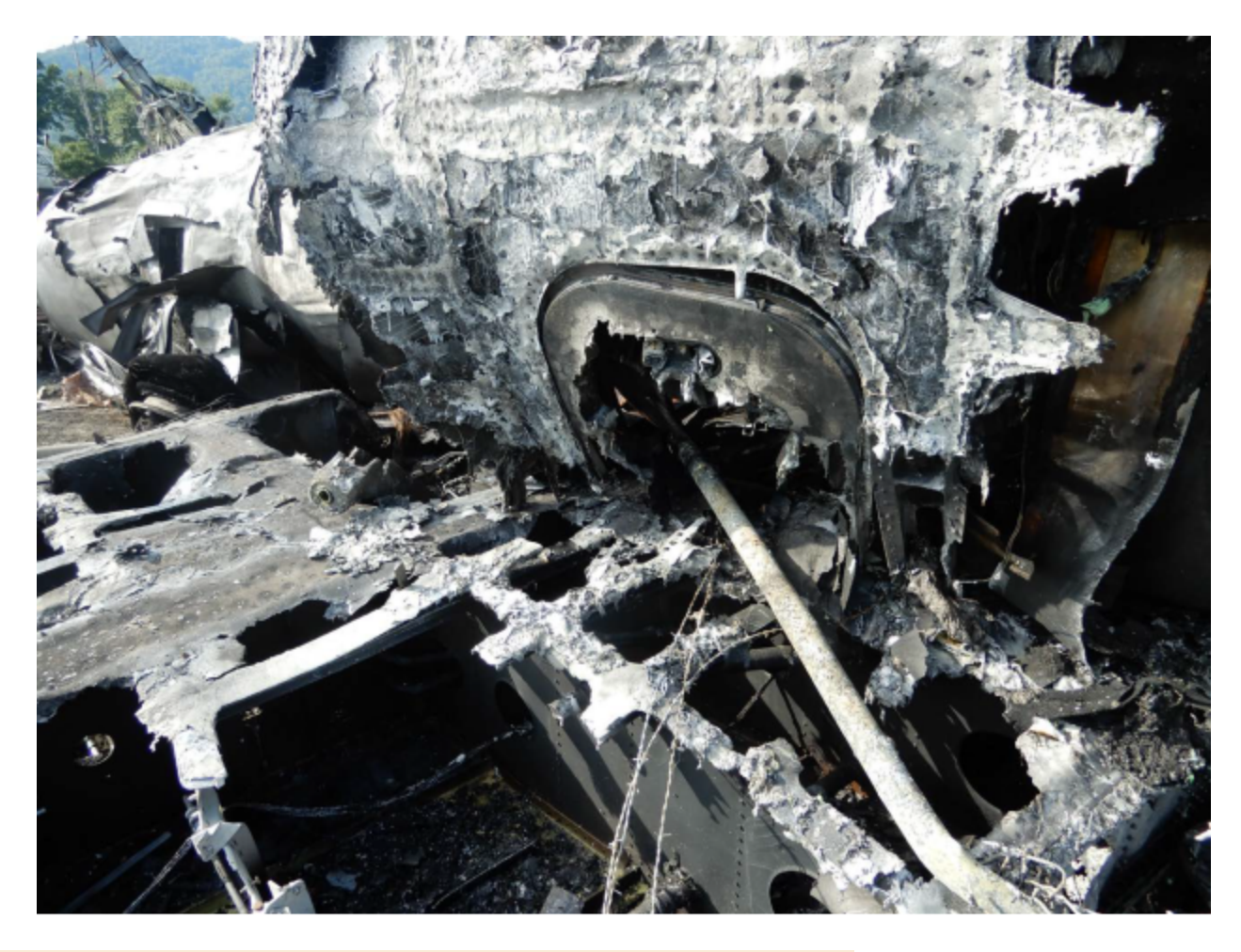
Figure 3: Emergency escape hatch impaled by a metal fence post.